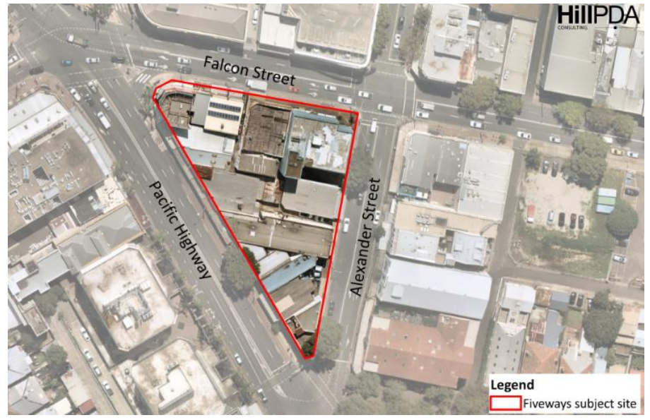
Figure 1: Fiveways subject site boundary

HillPDA was commissioned by Deicorp Projects (Crows Nest) Pty Ltd to undertake an economic impact assessment (the study) of a Planning Proposal pertaining to land referred to as the Fiveways Triangle site located in Crows Nest. Specifically, the Five Ways Triangle site relates to land bounded by Falcon Street, Alexander Street and Pacific Highway (the subject site).